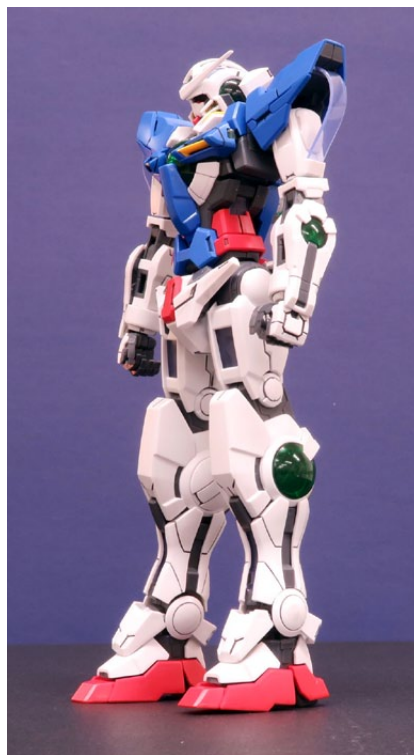
Two 1:100 scale Gundam figures (Bandai) built by Lars Knowles. Left: Gundam Ez8 , a custom variant of the original RX-79[G] Gundam Ground Type, one of the signature mobile suits in the 12-episode anime OVA series Mobile Suit Gundam: The 08th MS Team . Right: Gundam Exia, the close combat Gundam-type mobile suit featured in both seasons of Mobile Suit Gundam 00 .