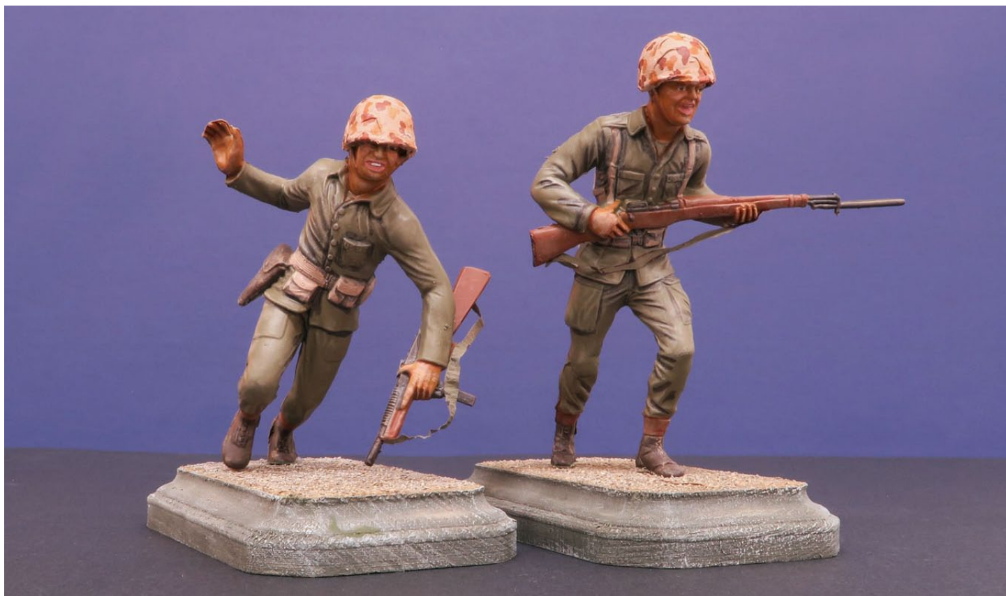
Frank Moore's 1:12 scale soft plastic Marine figures (Marx). Frank added after-market rifle slings and camouflaged helmet covers. Paints are Vallejo acrylics.